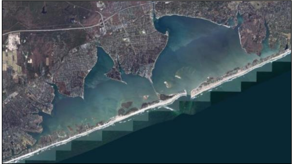
Figure 1 Shinnecock Bay